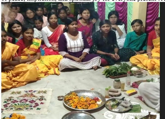
Worship of the goddess Saraswati by the students, SNEH

Saraswati, one of the principal goddesses in Hinduism, is revered as the Goddess of knowledge, wisdom, learning, arts, speech, music, and culture. She symbolizes purity, creativity, and enlightenment. It is believed that sincere, obedient, disciplined, and hardworking students who pursue knowledge with devotion are blessed by Goddess Saraswati with wisdom and a fulfilling life. On February 4 th 2025, Saraswati Puja was held at the SNEH campus. All students and teachers gathered to chant prayers and offer flowers in devotion to the Goddess, seeking her blessings for knowledge and wisdom. The ceremony created an atmosphere of peace, inspiration, and spiritual joy for everyone present. The expenditure of this program was supported by SNEH.