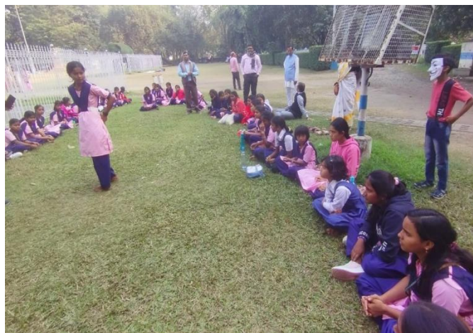
Students performing dance, games etc., at Alipore Zoological Garden, Kolkata