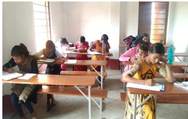
The students of SNEH are trained in computer skills. They attend the exams regularly