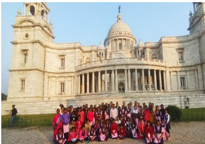
Victoria Memorial, Kolkata