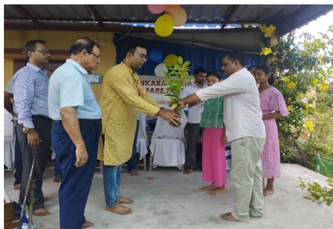
Distribution of the Saplings, Jackfruit and lamboo trees etc, SNEH

"Take up one idea. Make that one idea your life; think of it, dream of it, live on that idea. Let the brain, muscles, nerves, every part of your body be full of that idea and just leave every other idea alone" - Swami Vivekananda