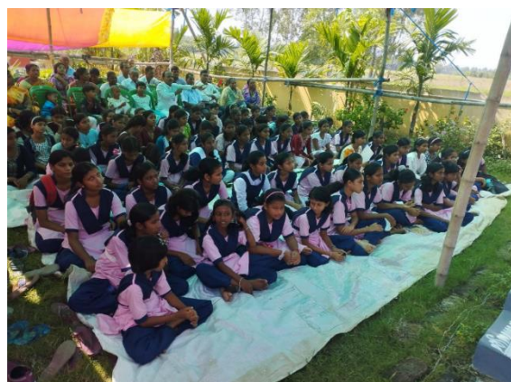
Gatherings of Students, Faculty, Guardian and other Guests