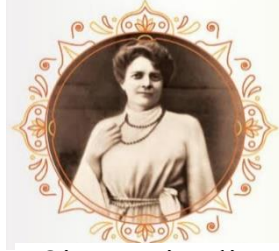
Sister Nivedita (1867-1911)

Vol. 1, No. 1: October 2025 (e-Newsletter of SNEH)