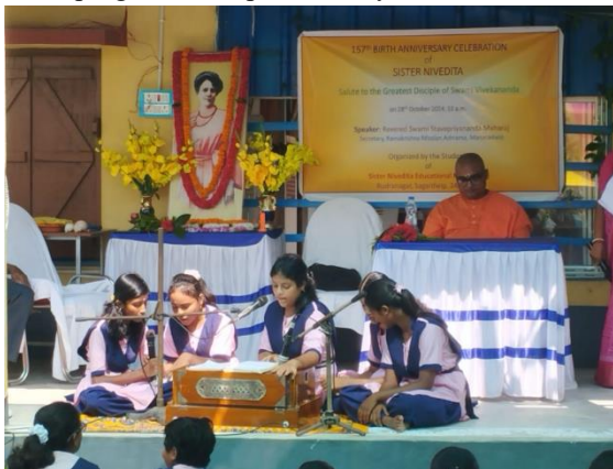
Cultural performances by the Students, SNEH